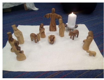
A Godly Play session for Chaplaincy Reps

Chaplaincy Reps are also invited to take part in additional activities intended to nurture faith, such as Godly Play, Praying the Rosary, Prayer Walks in the Labyrinth, Understanding Spiritual Styles.