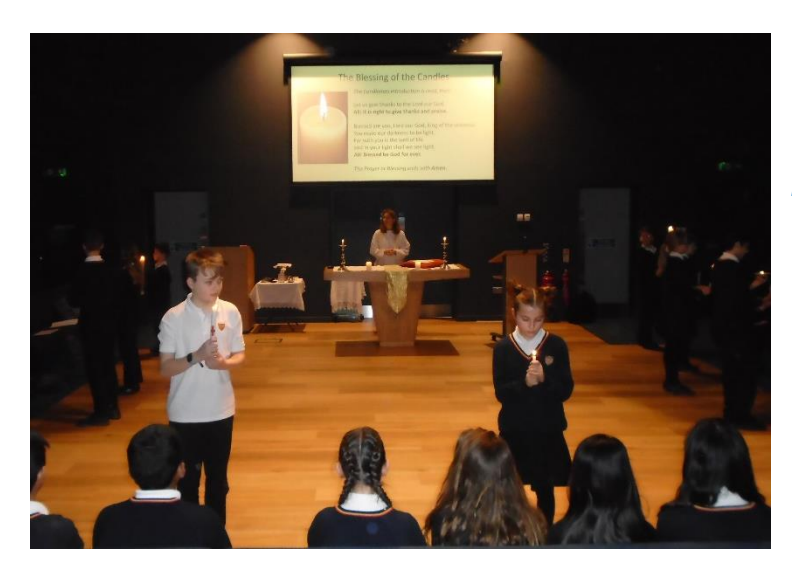
The Blessing of the Candles in the Year 7 Candlemas Eucharist in the Pilgrim Theatre

Each tutor group elects 2 Chaplaincy Representatives who take responsibility for leading weekly Tutor Group Worship in classrooms. Chaplaincy Reps will also take leadership roles in our end of term liturgies and our regular celebrations of Anglican Eucharist and Roman Catholic Mass , which sometimes include whole year groups in the Pilgrim Theatre and are sometimes smaller voluntary services held in the Chaplaincy.